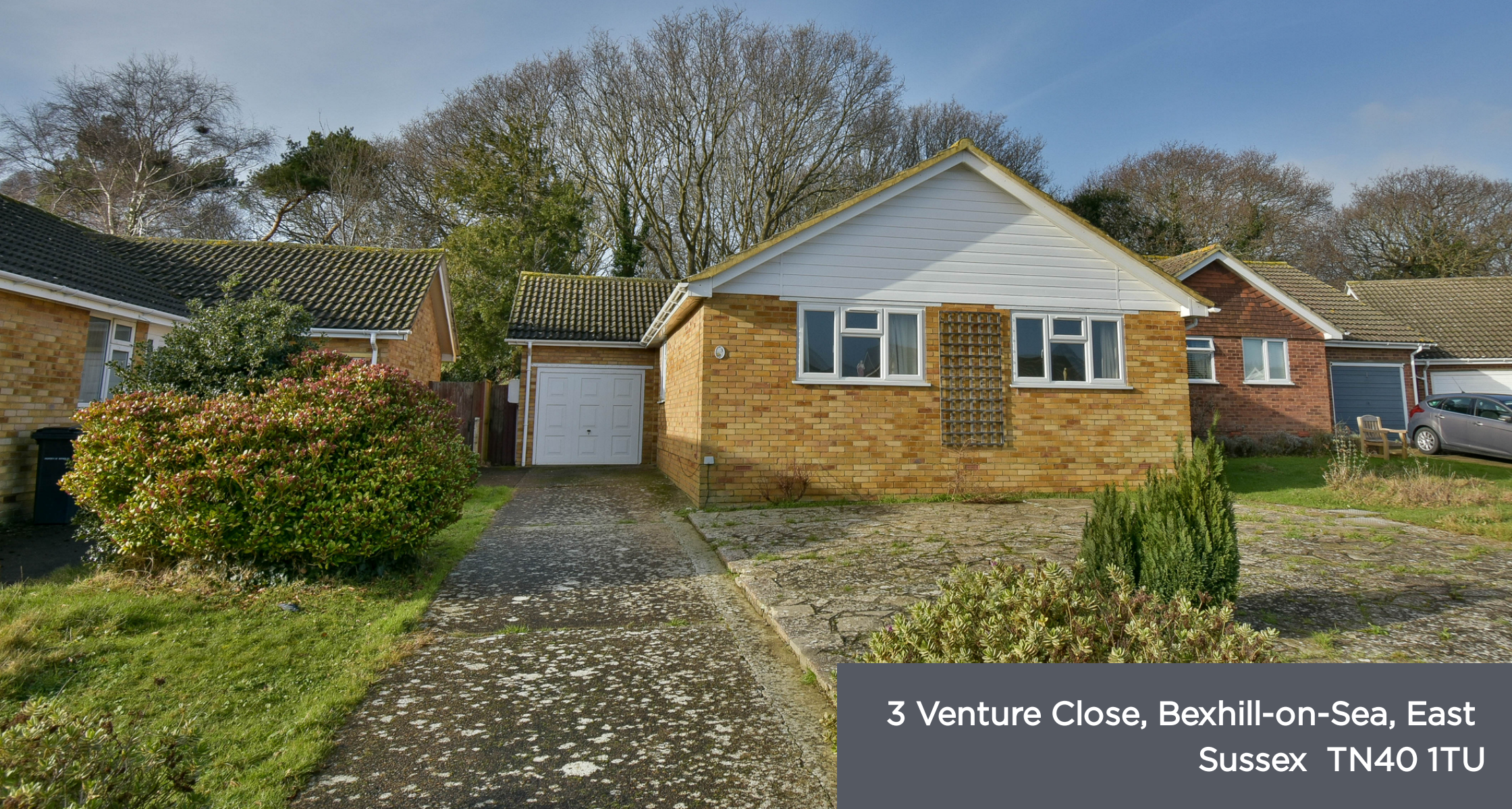
3 Venture Close, Bexhill-on-Sea, East Sussex TN40 1TU