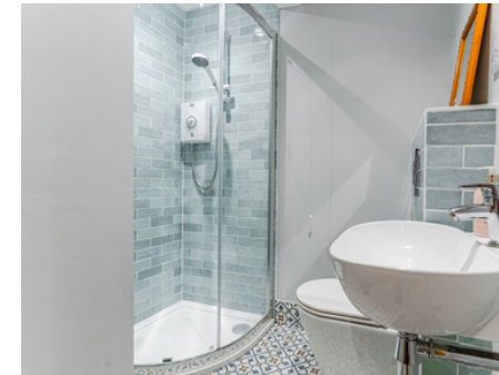
6 Common Road, Langford, Biggleswade, Bedfordshire, SG18 9SA