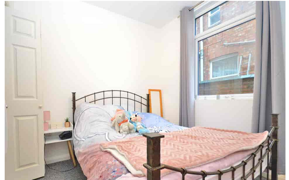
40a Harlestone Road, Northampton NN5 7AG £110,000 - Share of Freehold