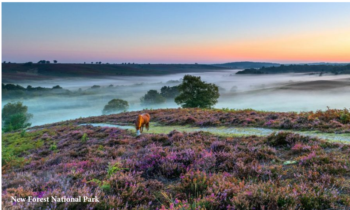
New Forest National Park