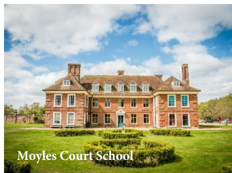
Moyles Court School