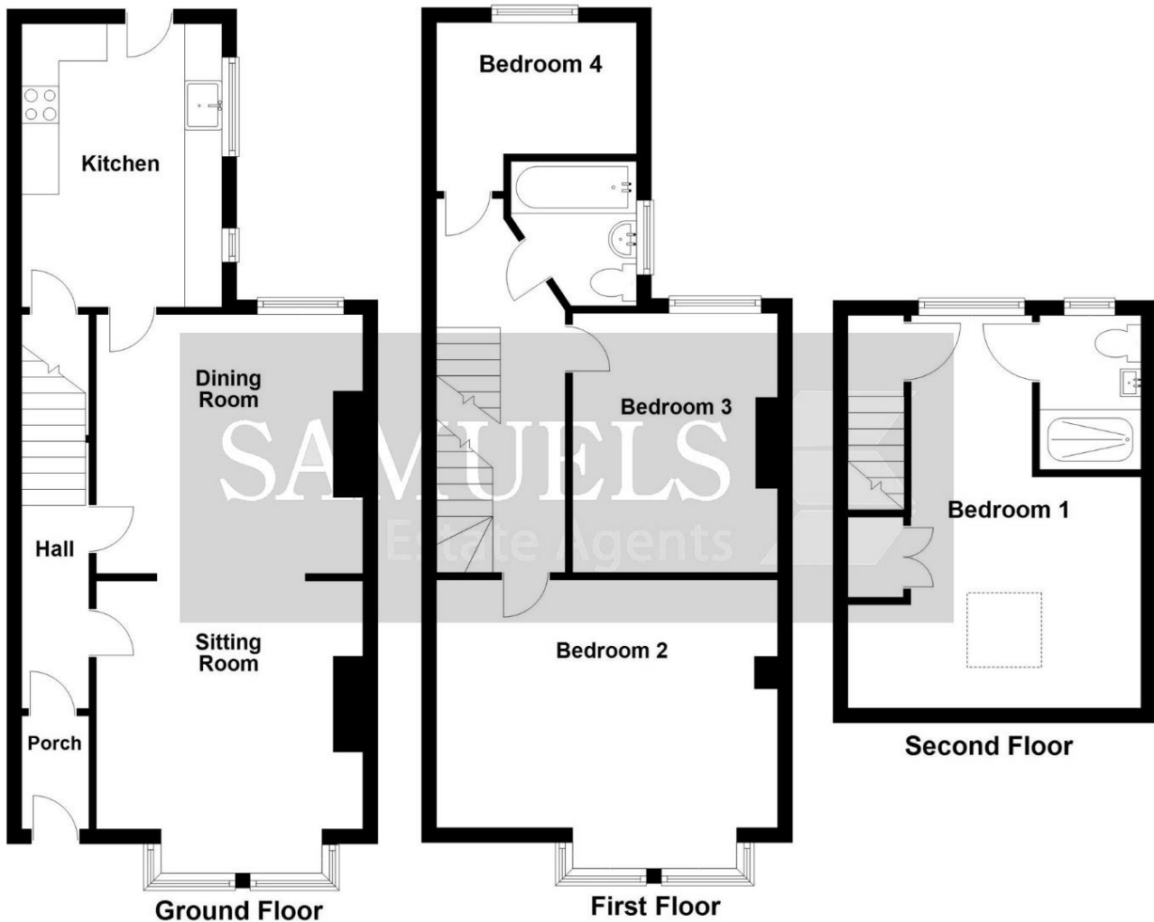
Ground Floor First Floor Total area: approx. 107.8 sq. metres (1160.8 sq. feet)

Floor plan for illustration purposes only – not to scale