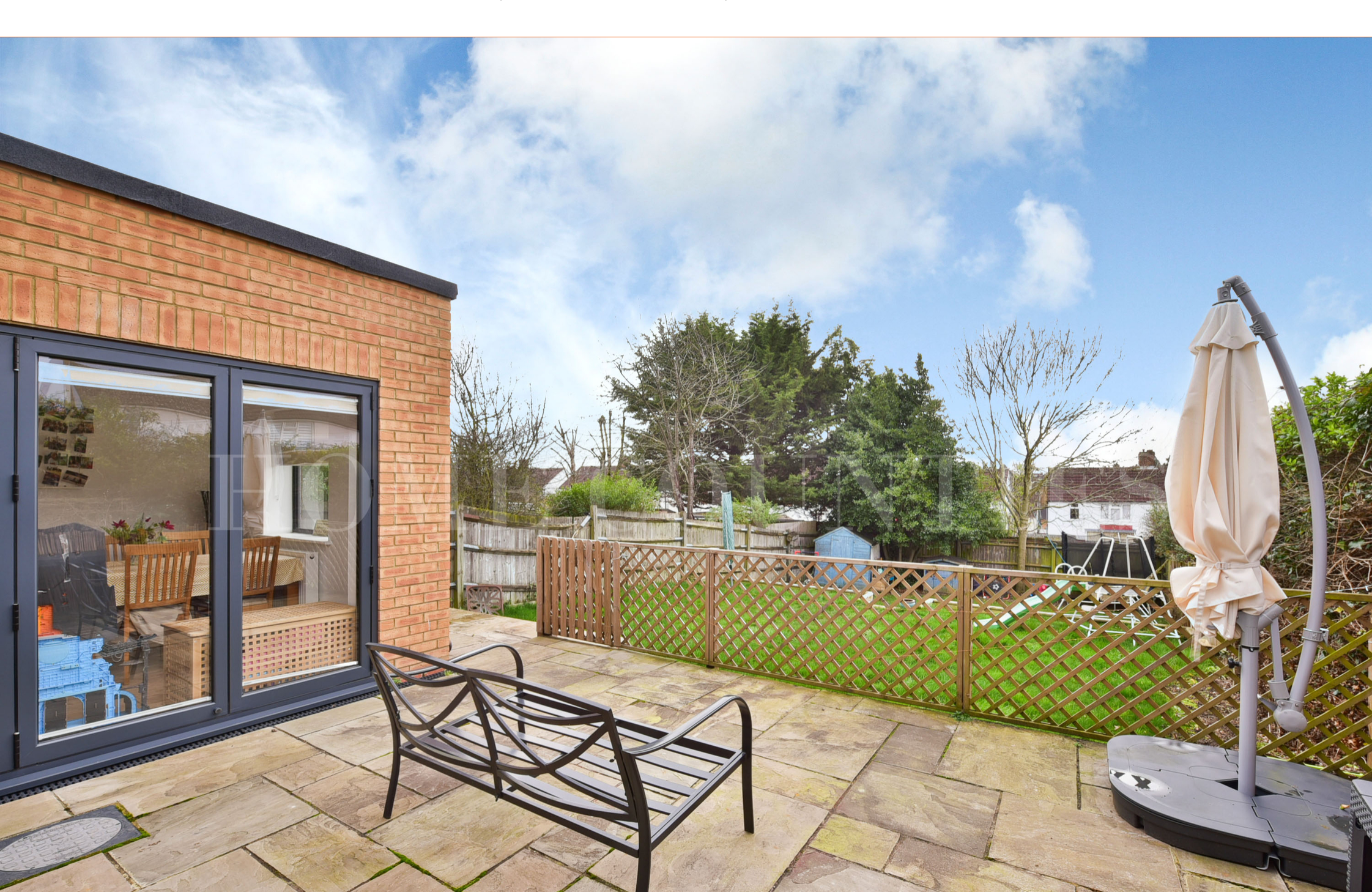
TEMPEST AVENUE, POTTERS BAR, HERTFORDSHIRE. EN6 5JY