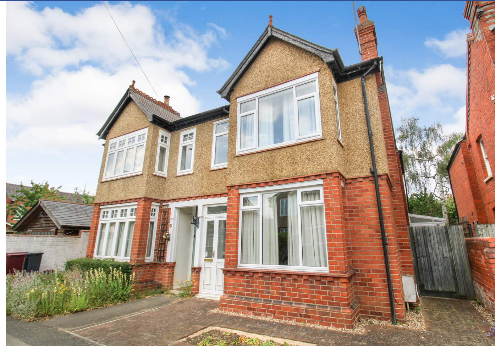
Melrose Avenue, Reading, Berkshire. RG6 7BN.