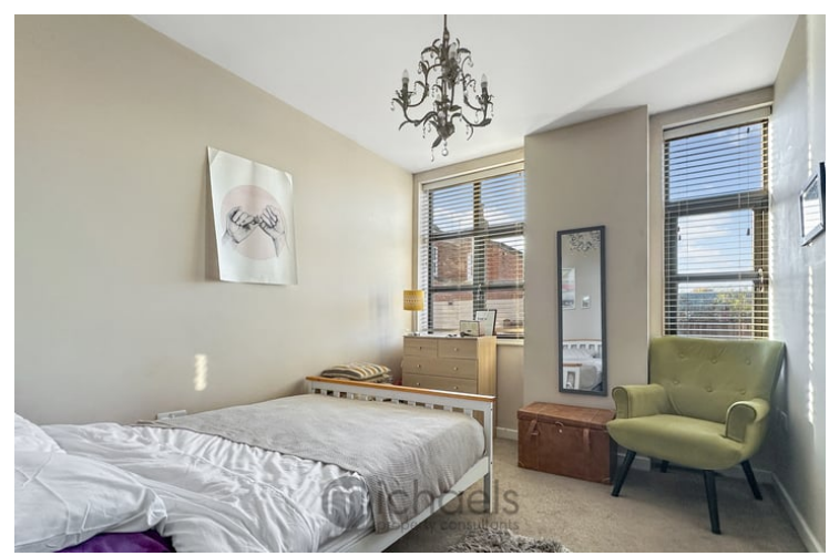
10' 4" x 9' 4" (3.15m x 2.84m) Large UPVC windows to rear aspect, radiator.