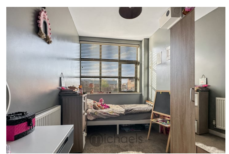
11'7" x 7'1" (3.53m x 2.16m) Large UPVC window to rear aspect, radiator.