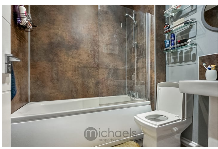
6' 2" \times 5' 9" (1.88m \times 1.75m) Panelled bath with shower over, low level W.C, vanity wash unit, extractor fan, radiator.