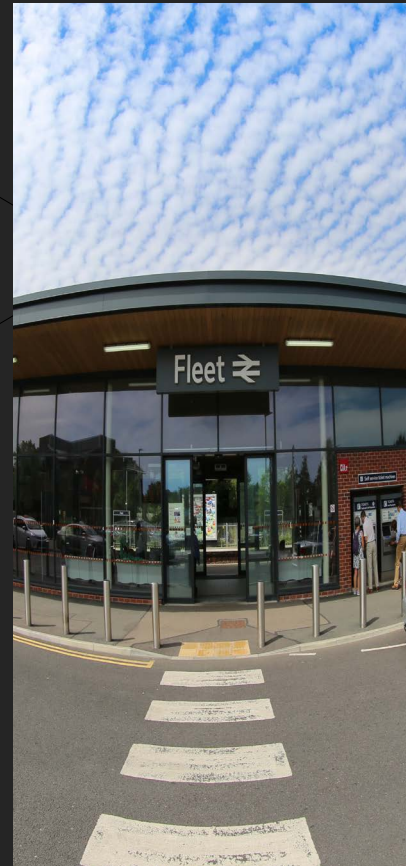
Fleet Train Station