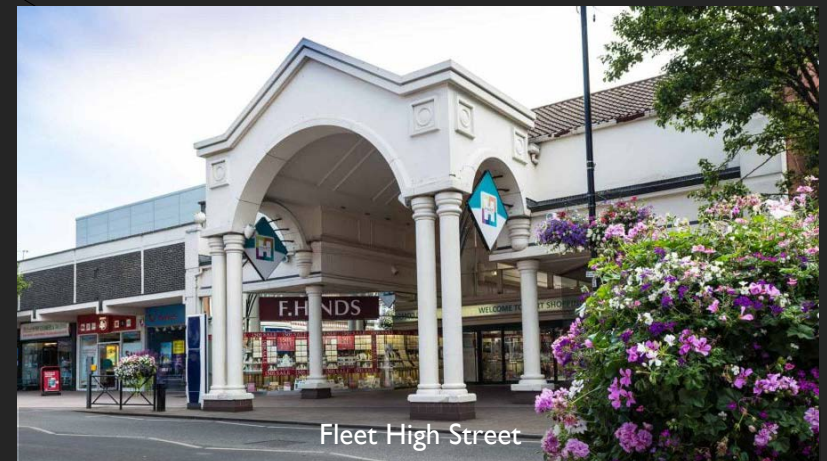
Fleet High Street