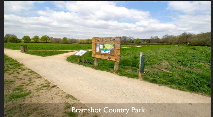
Bramshot Country Park