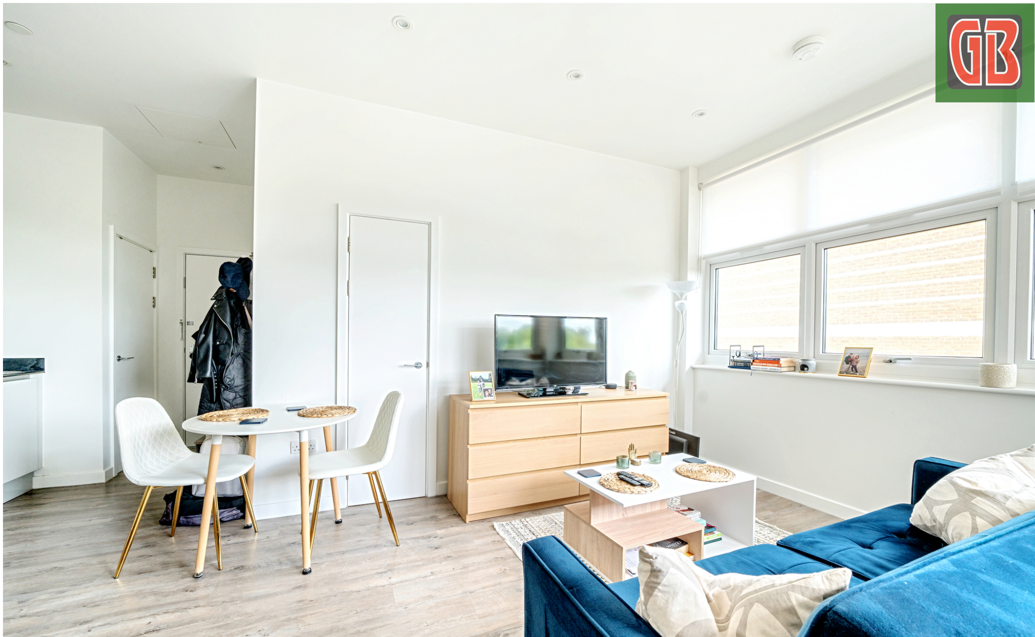
Flat 37, 4 Wraysbury House, London Road, Staines-upon-Thames. TW18 4BP. 1 Bedroom Apartment - £230,000 Leasehold