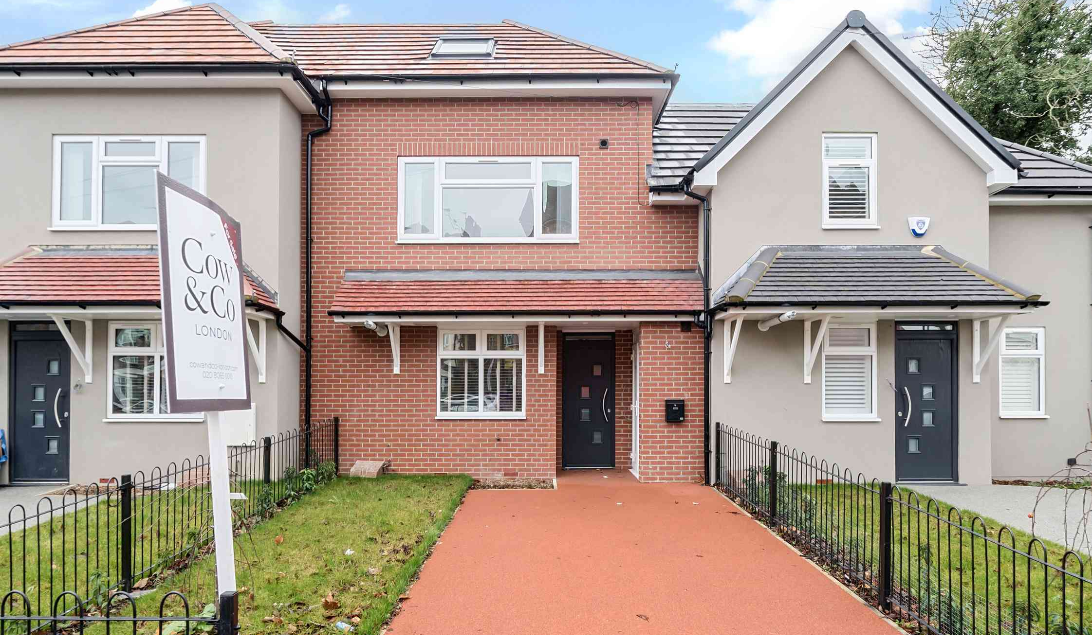
Woodgrange Avenue, Harrow, HA3 0XG