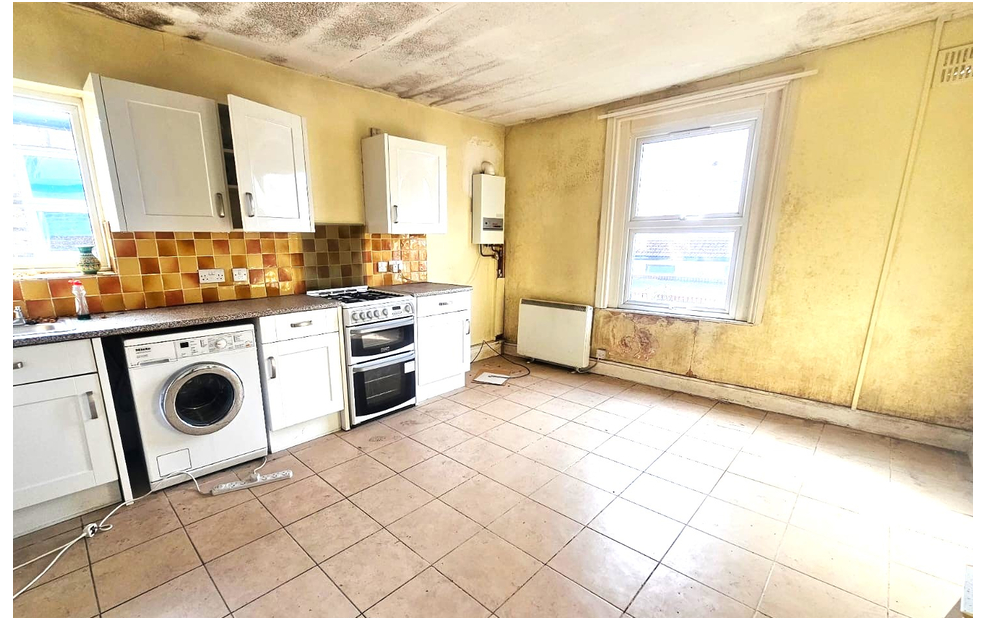
Chamberlayne Road, Kensal Rise, London NW10 3JH £729,000 - Leasehold