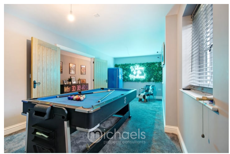
21' 11" x 9' 10" (6.68m x 3.00m)