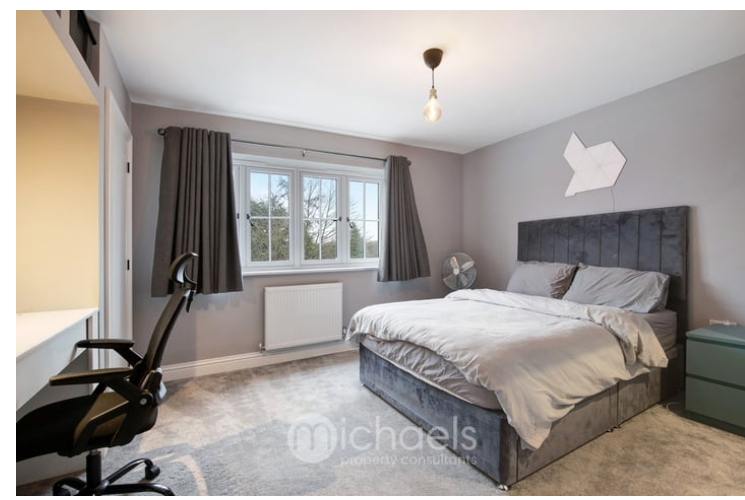
15'8" x 11'1" (4.78m x 3.38m)