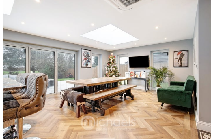
28' 10" x 14' 5" (8.79m x 4.39m)