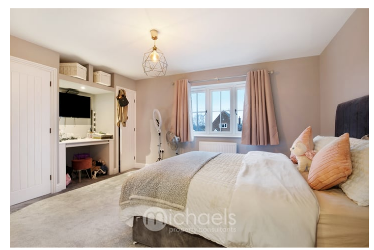
14' 1" x 11' 1" (4.29m x 3.38m)