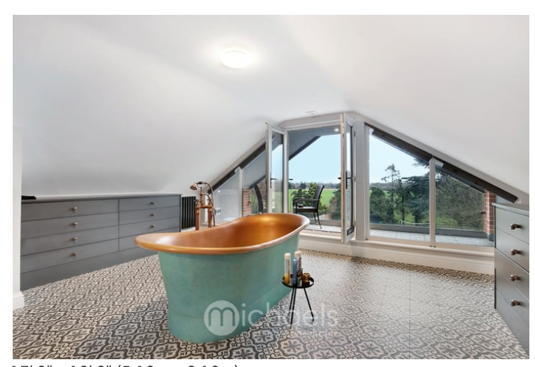
17' 0" x 10' 2" (5.18m x 3.10m)