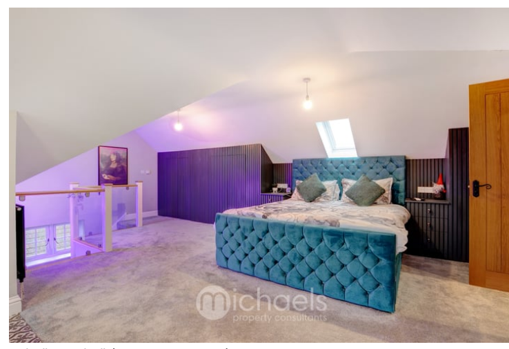
22' 7" x 12' 1" (6.88m x 3.68m)