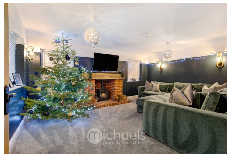
18' 0" x 13' 1" (5.49m x 3.99m)