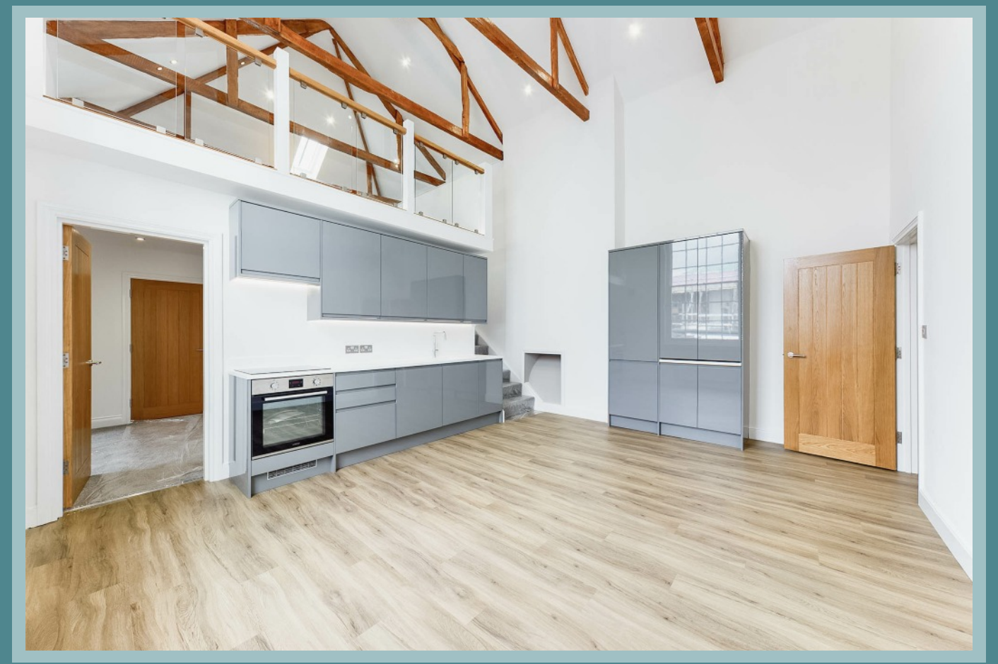
Flat 2, 89 Fore Street • Kingsbridge