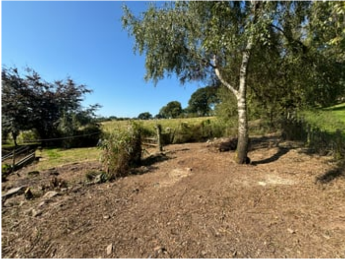
GARDEN (THIRD IMAGE)