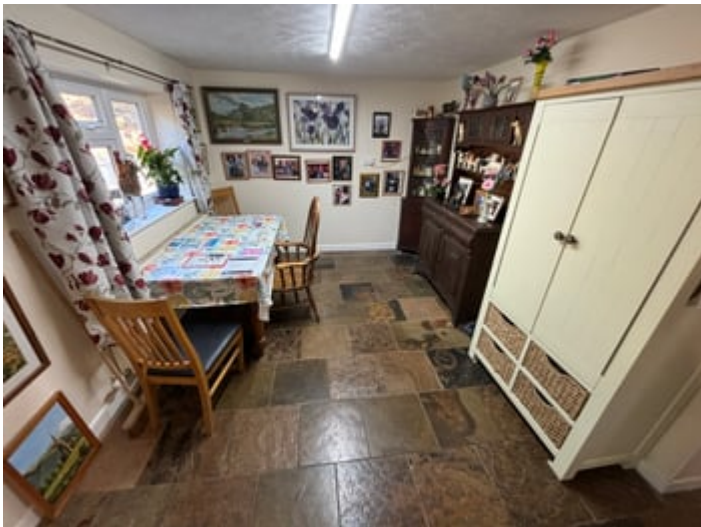
KITCHEN/DINER (THIRD IMAGE)