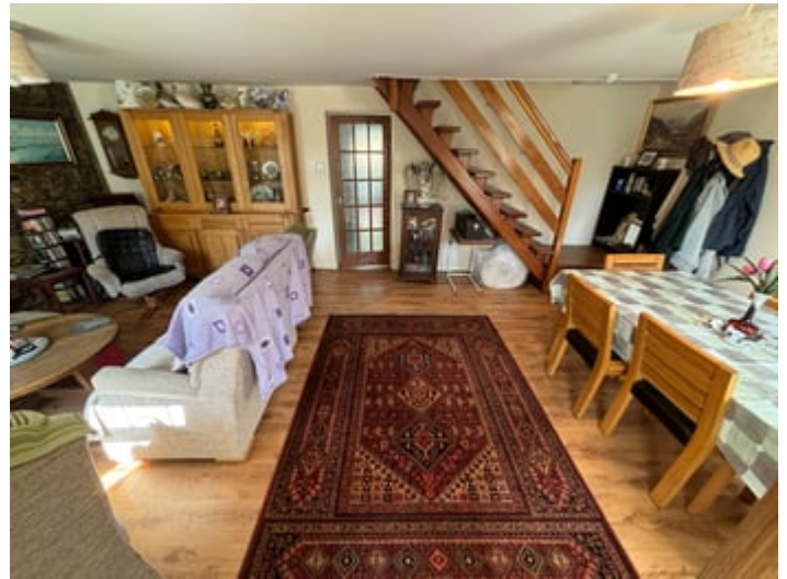
LIVING ROOM (SECOND IMAGE)

23' 4" x 14' 7" (7.11m x 4.45m). With exposed stone walls with an impressive open fireplace housing a large cast iron multi fuel stove, laminate flooring, two radiators, open tread staircase to the first floor accommodation.