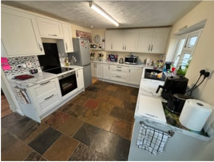
KITCHEN/DINER (SECOND IMAGE)

24' 8" x 10' 2" (7.52m x 3.10m). A modern Shaker kitchen with a range of wall and floor units with work surfaces over, 1 1/2 sink and drainer unit, integrated electric oven, 4 ring hob with extractor hood over. Separate dining area with radiator and tiled flooring.