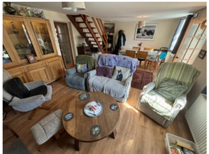
LIVING ROOM (THIRD IMAGE)