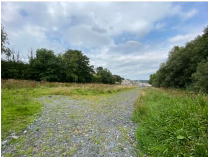
REAR PADDOCK (FIRST IMAGE)