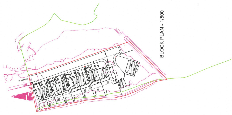
BLOCK PLAN - 1/500

Ordnance Survey, (c) Crown Copyright 2018. All rights reserved. Licence number 100022432