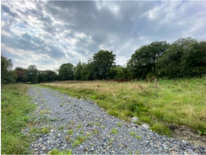
THE DEVELOPMENT SITE (SECOND IMAGE)