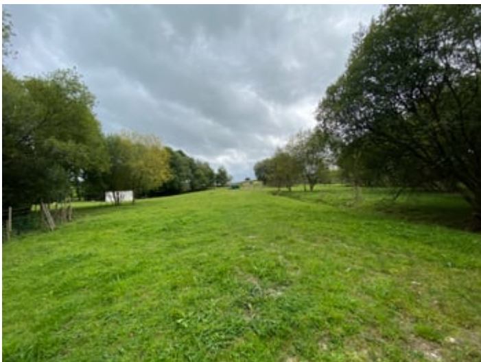
REAR PADDOCK (FIRST IMAGE)