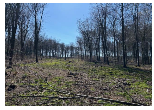
Auction guide price from £135,000 to £145,000*

Thursday 12<sup>th</sup> June 2025 12pm The Theatre, The Royal Bath and West Showground, Shepton Mallet, BA4 6QN Bid remotely via Livestream, in person or by proxy.