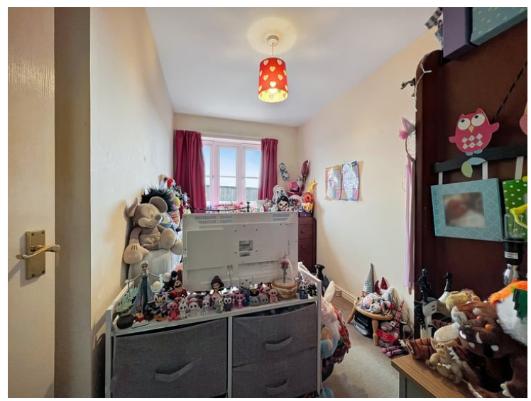
11' 2" x 7' 8" (3.40m x 2.34m)