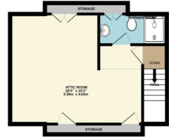
1ST FLOOR 354 sq.ft. (32.8 sq.m.) approx.