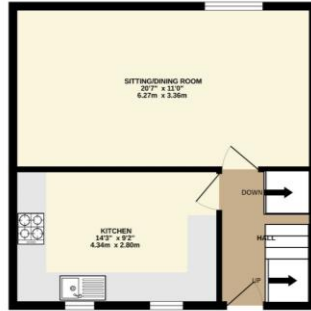
GROUND FLOOR 418 sq.ft. (38.9 sq.m.) approx.