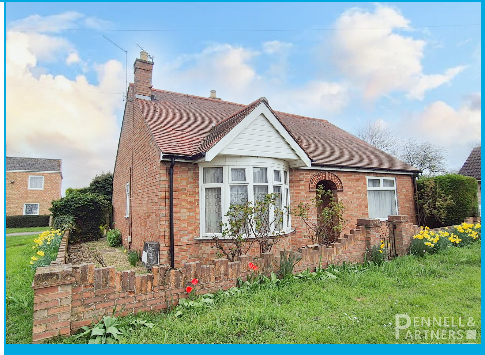
44 NORTH GREEN, WHITTLESEY, PETERBOROUGH, CAMBRIDGESHIRE. PE7 2BQ