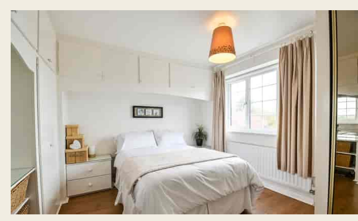
COUNCIL TAX Band E.

5.54m \times 5.11m (18' 2" \times 16' 9") approached via an electric roller shutter entrance door and having UPVC double glazed window and personal access door to side, loft hatch to independent loft storage space, light and power.