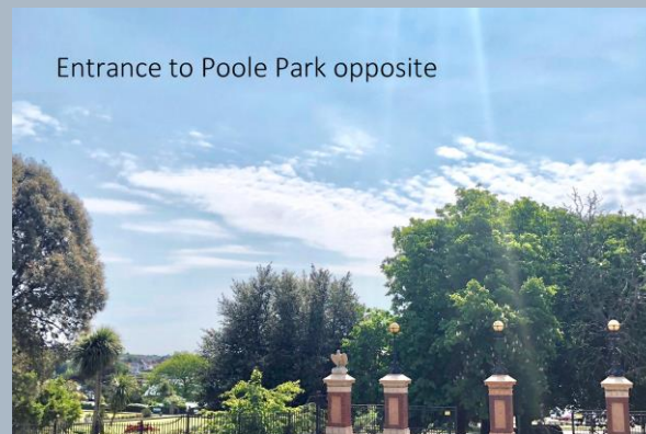
Entrance to Poole Park opposite