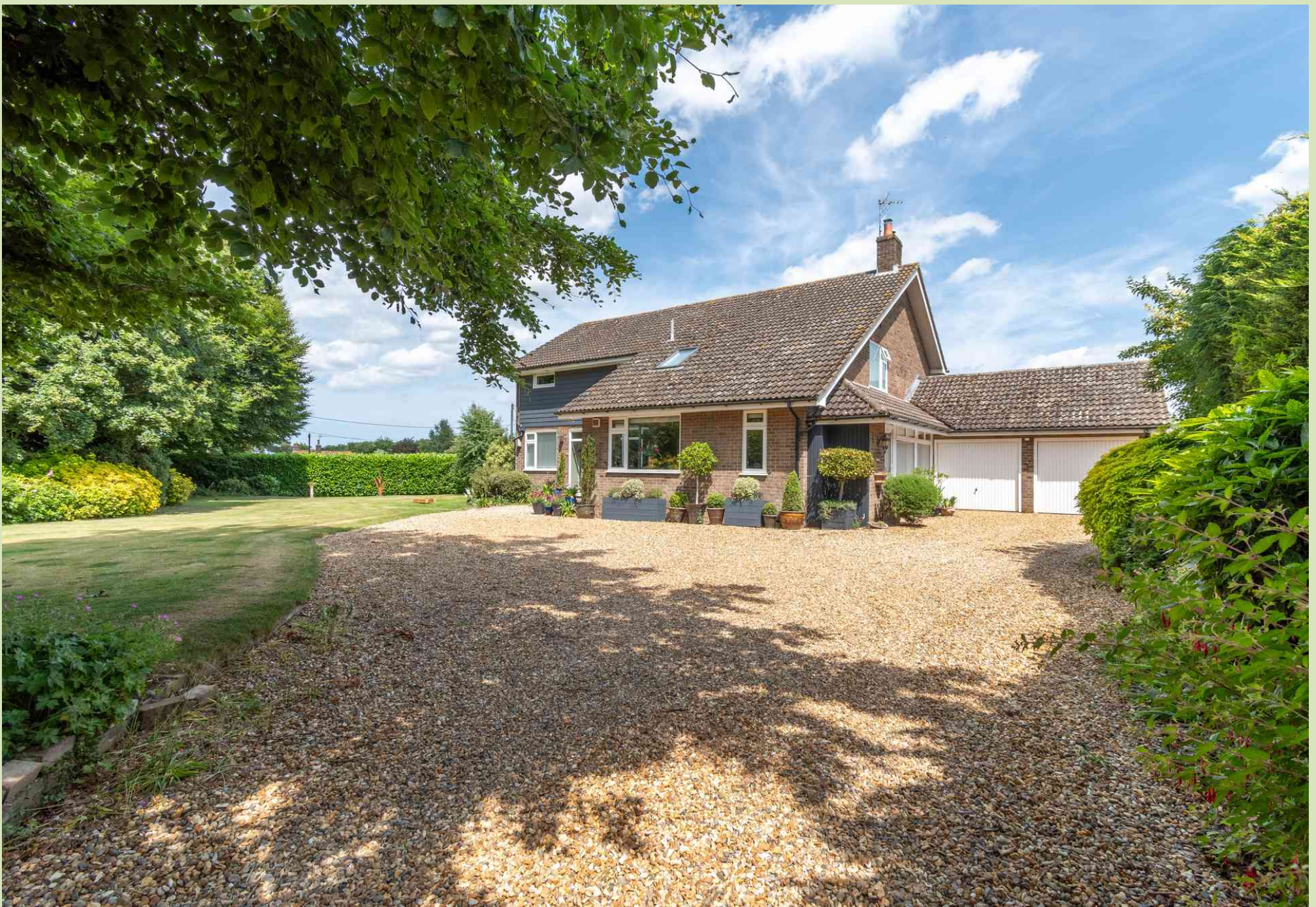
Roseberry Topping, Great Bircham Guide Price £750,000