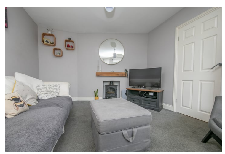
12^{\circ}\,09^{\circ} x 10^{\circ}\,09^{\circ} (3.89m x 3.28m) Double glazed window to front, log burner with tiled hearth and wood mantle, radiator.