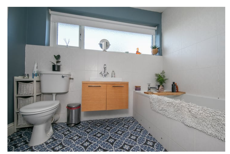
8'\ 8''\ x\ 7'\ 5'''\ (2.64\ m\ x\ 2.26\ m) Double glazed obscure window to rear, under floor heating, part tiled walls, bath low level WC, wall hung vanity unit.