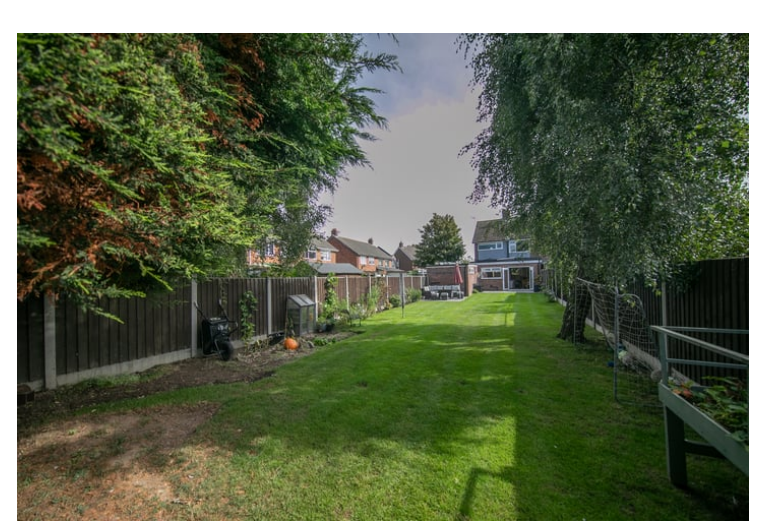
A well established rear garden, the garden consist of a generous patio area, lawn, garden shed, and a converted garages currently used as a cinema room but ideal for home office.