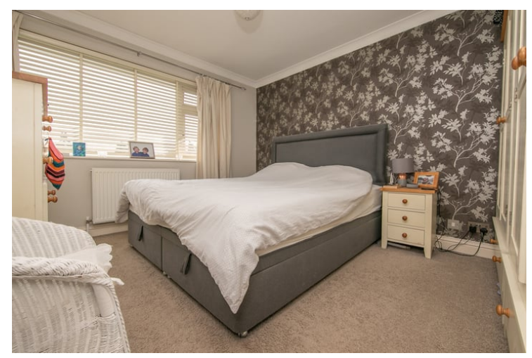
11' 01" x 10' 2" (3.38m x 3.10m) Double glazed window to front, radiator.