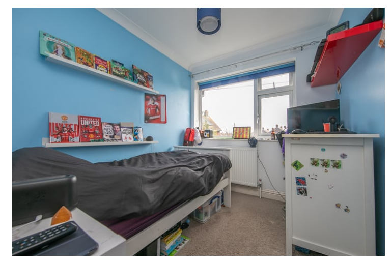
8'9" \times 8'7" (2.67m x 2.62m) Double glazed window to front, radiator.