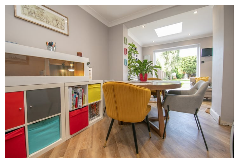
19'01" \times 8'09" (5.82m x 2.67m) Open plan, French doors to rear, radiator,.