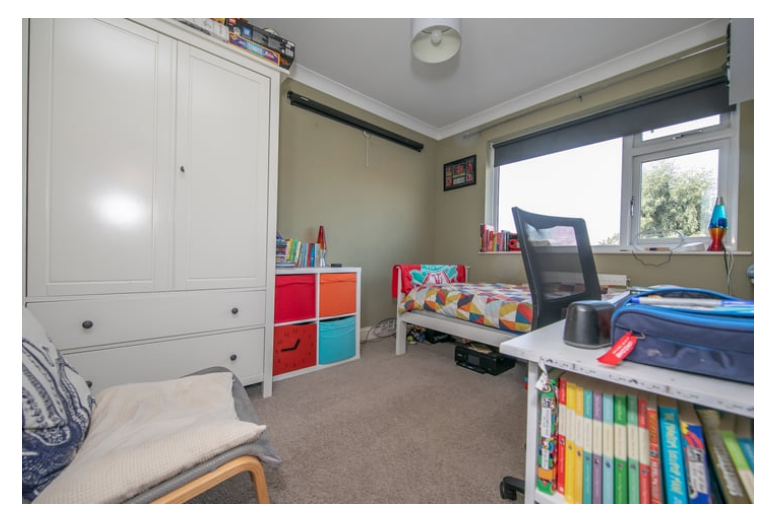
8'\,11''\,x\,11'\,0'' (2.72m x 3.35m) Double glazed window to rear, radiator.