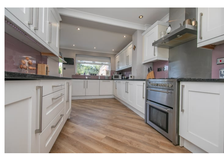
18' 1" x 8' 09" (5.51m x 2.67m) Double glazed window to rear, fitted kitchen including a range of wall and base units, granite worktop, inset sink, pull out larder, integrated washing machine, dish washer, bin storage, cooker and hob, pantry style cupboard, radiator.