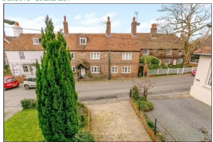
There is a walled off street parking area to front with small shrubs planted to borders.