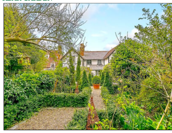
There is a rear south facing garden which has been cleverly landscaped with regency style hedging theme and a host of shrubs and flowers, there is a good side garden shed 7'10 x 5'11.