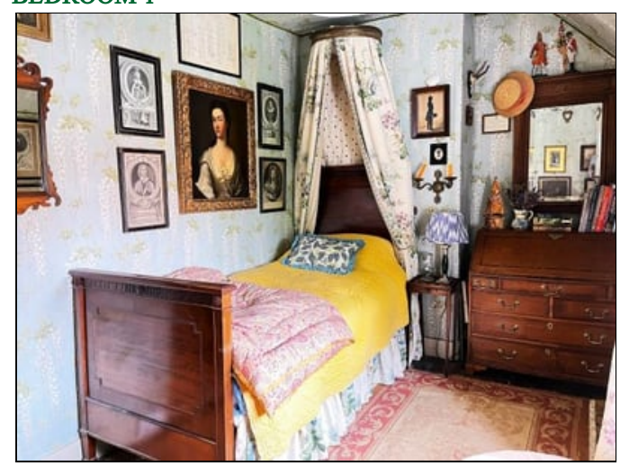
14' 1" x 8' 0" (4.29m x 2.44m) Window to front.