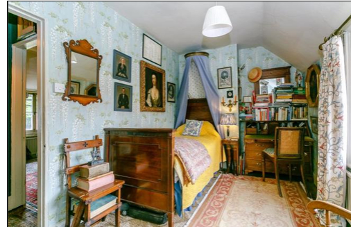
36 HIGH STREET, CHIPSTEAD, SEVENOAKS, KENT TN13 2RP

Step back in time to a bygone era with this almost miniature stately home. Quirky character blended with modern day convenience to create the most delightful two bedroom cottage. Parking to front and fantastic garden to rear. Lounge and dining room with fireplace. Every attention to detail in decoration and fittings creates a unique historic style.