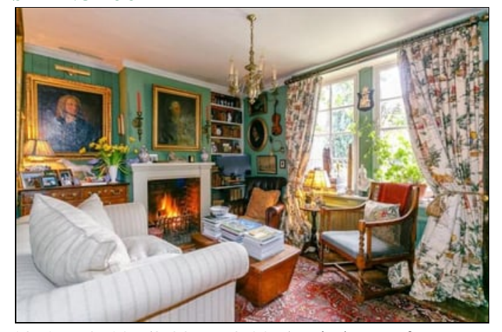
13' 1" x 9' 10" (3.99m x 3.00m) Window to front, wood surround fireplace, shelving, part wood panelled walls, door to dining room.