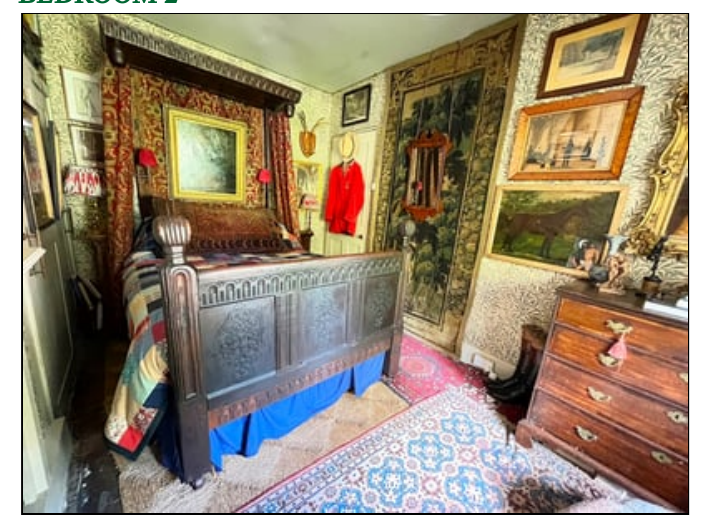
12' 6" \times 9' 1" (3.81m \times 2.77m) Window to rear, cast iron fireplace.