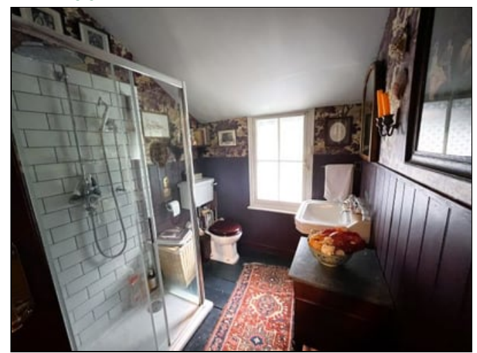
Comprising enclosed shower cubicle, pedestal wash hand basin, low level W.C., airing cupboard.