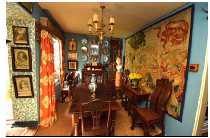
15' 10" x 7' 9" (4.83m x 2.36m) Window to rear, radiator, fireplace, open to kitchen.