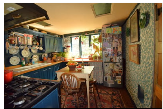
11' 10" x 9' 7" (3.61m x 2.92m) Wall and base units, range cooker with extractor above, solid wood worktops, enamelled single drainer sink unit, door to garden.