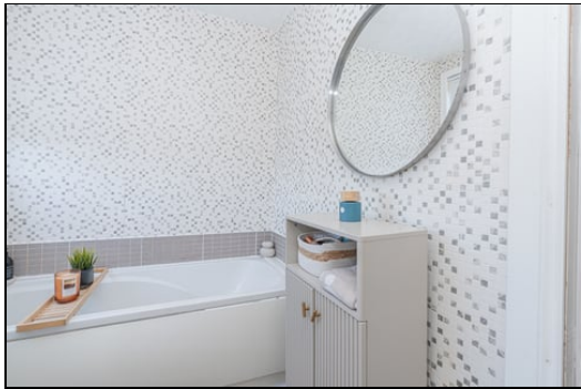
2.57m x 1.91m (8' 5" x 6' 3")