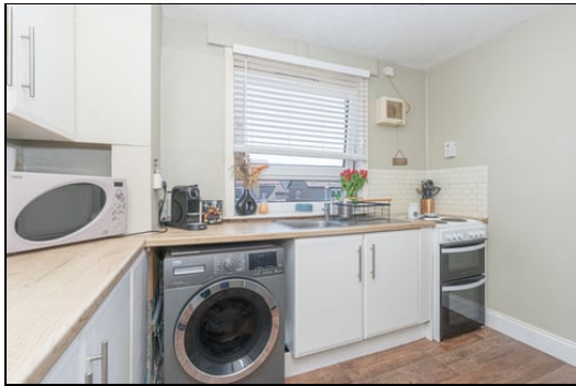
3.10m x 2.74m (10' 2" x 9' 0")