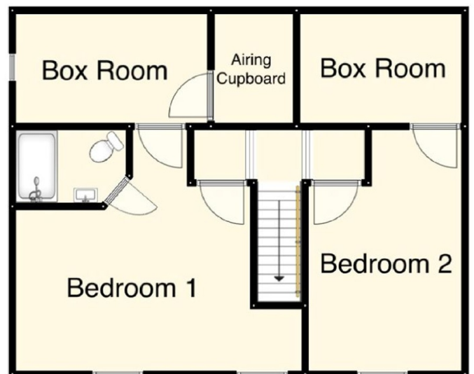
Teifi View SA38 9JL