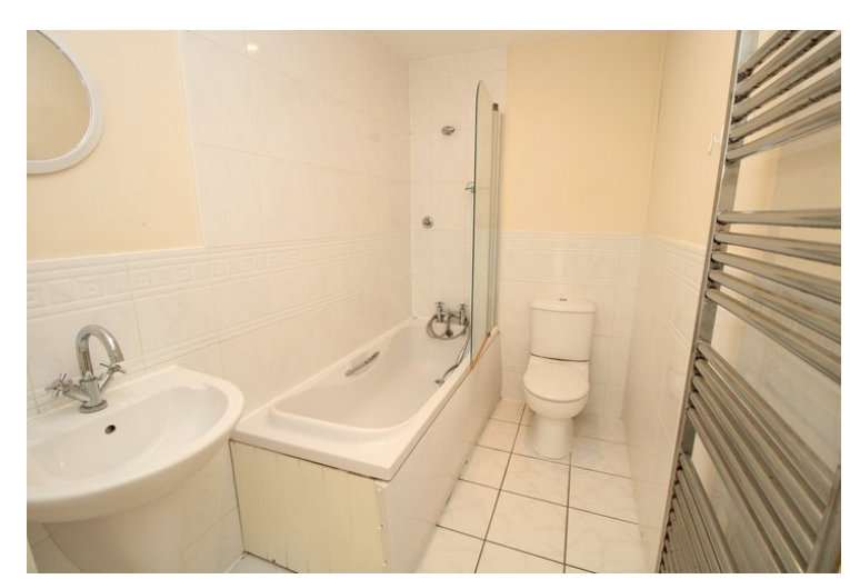
Low level WC, pedestal wash hand basin, panel bath with mixer tap and shower over, chrome heated towel rail, spot lights.