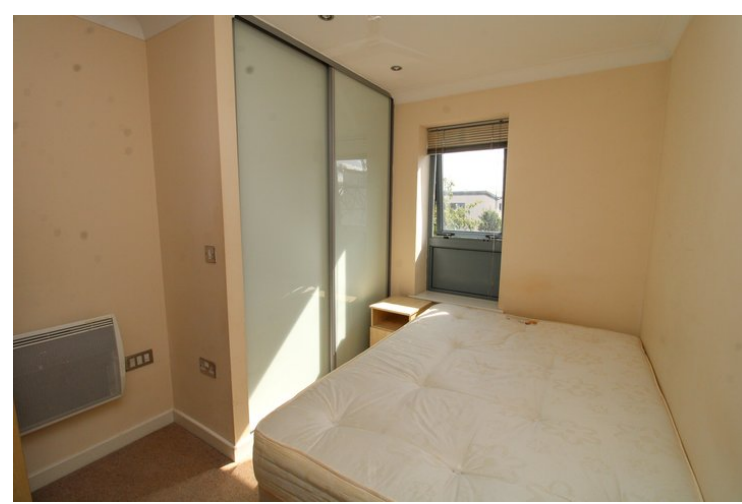
10'\ 2''\ x\ 8'\ 3''\ (3.10m\ x\ 2.51m) UPVC window to rear, double built in wardrobes, electric radiator.