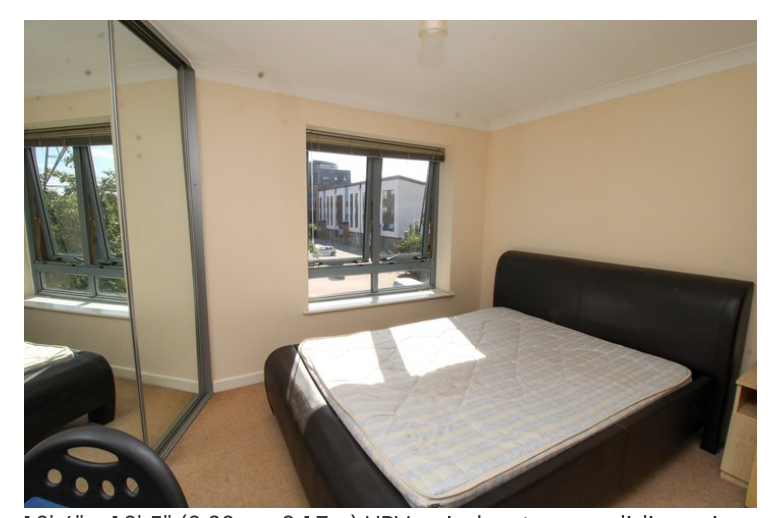
10' 6" x 10' 5" (3.20m x 3.17m) UPVc window to rear, sliding mirror fronted wardrobes, electric radiator.