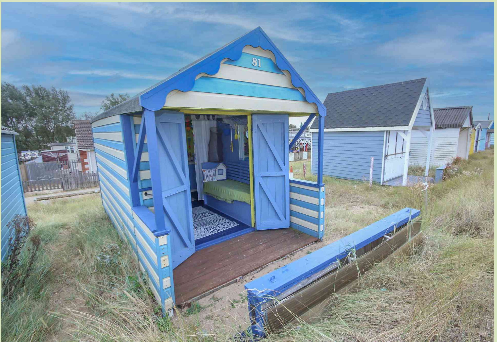
81 North Beach , Heacham Guide Price £12,950