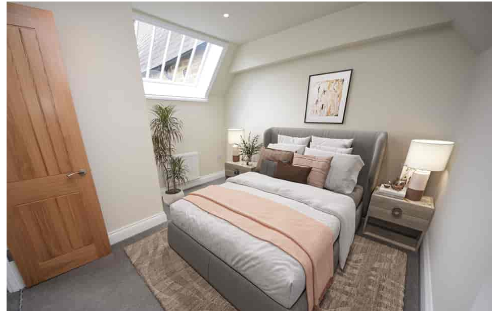
2 The Old Elephant & Castle, Causeway, Banbury, Oxfordshire. OX16 4SN Guide Price £265,000 - Freehold