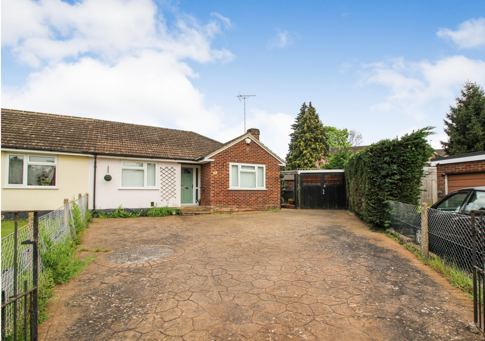
Causmans Way, Tilehurst, Reading.