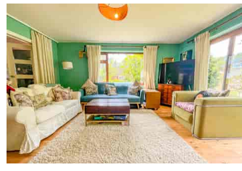
The Sidings, Station Road, Crowhurst, East Sussex TN33 9DB