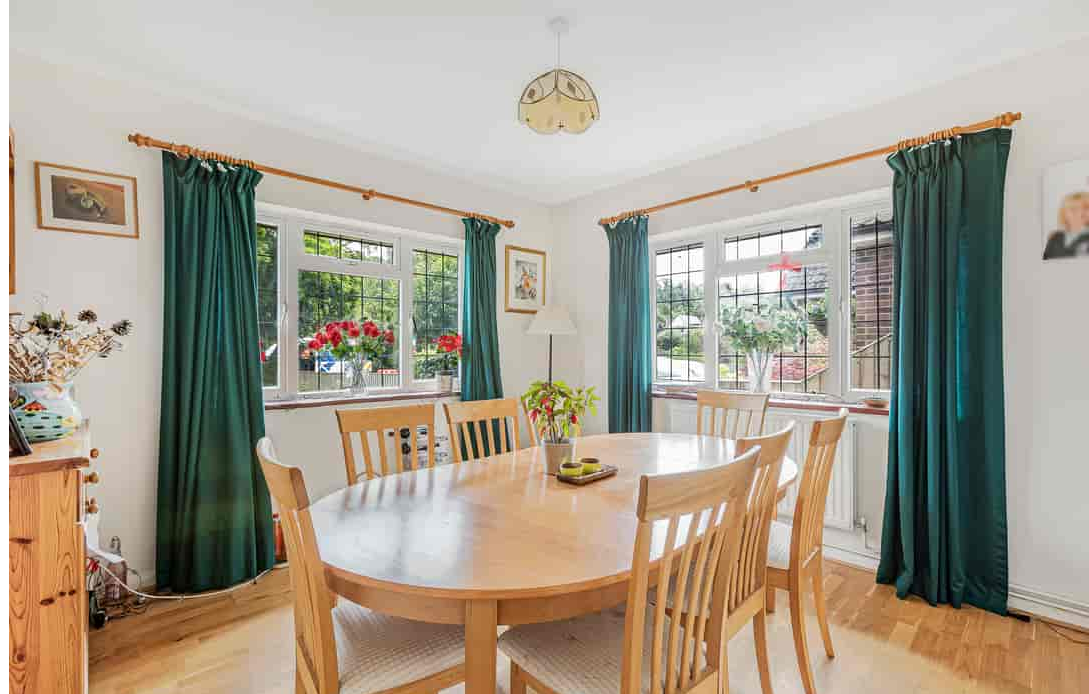
321 Marlow Bottom, Marlow, Buckinghamshire SL7 3QF Guide Price £685,000 - Freehold