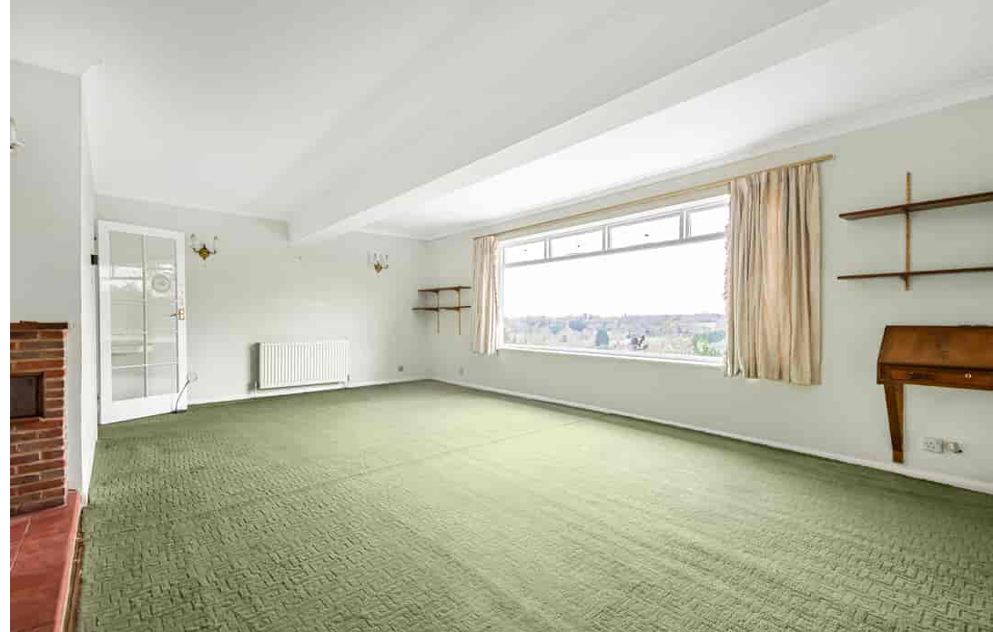
97 New Road, Marlow, Buckinghamshire SL7 3NN Guide Price £525,000 - Freehold