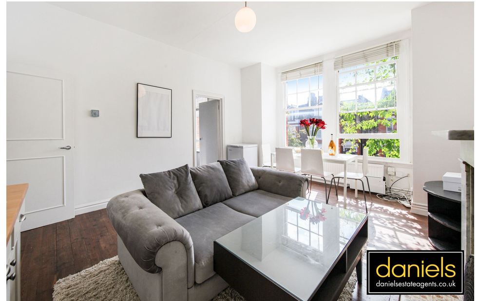
Dyne Road, Kilburn, London NW6 7XG £2,250 pcm