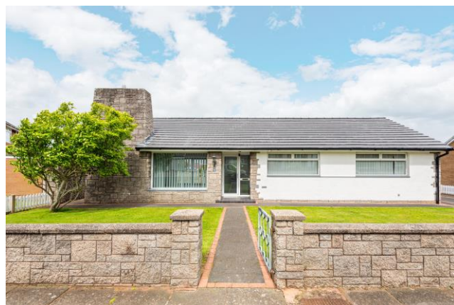
FRONT OF THE PROPERTY

TENURE We are informed the tenure is Freehold.