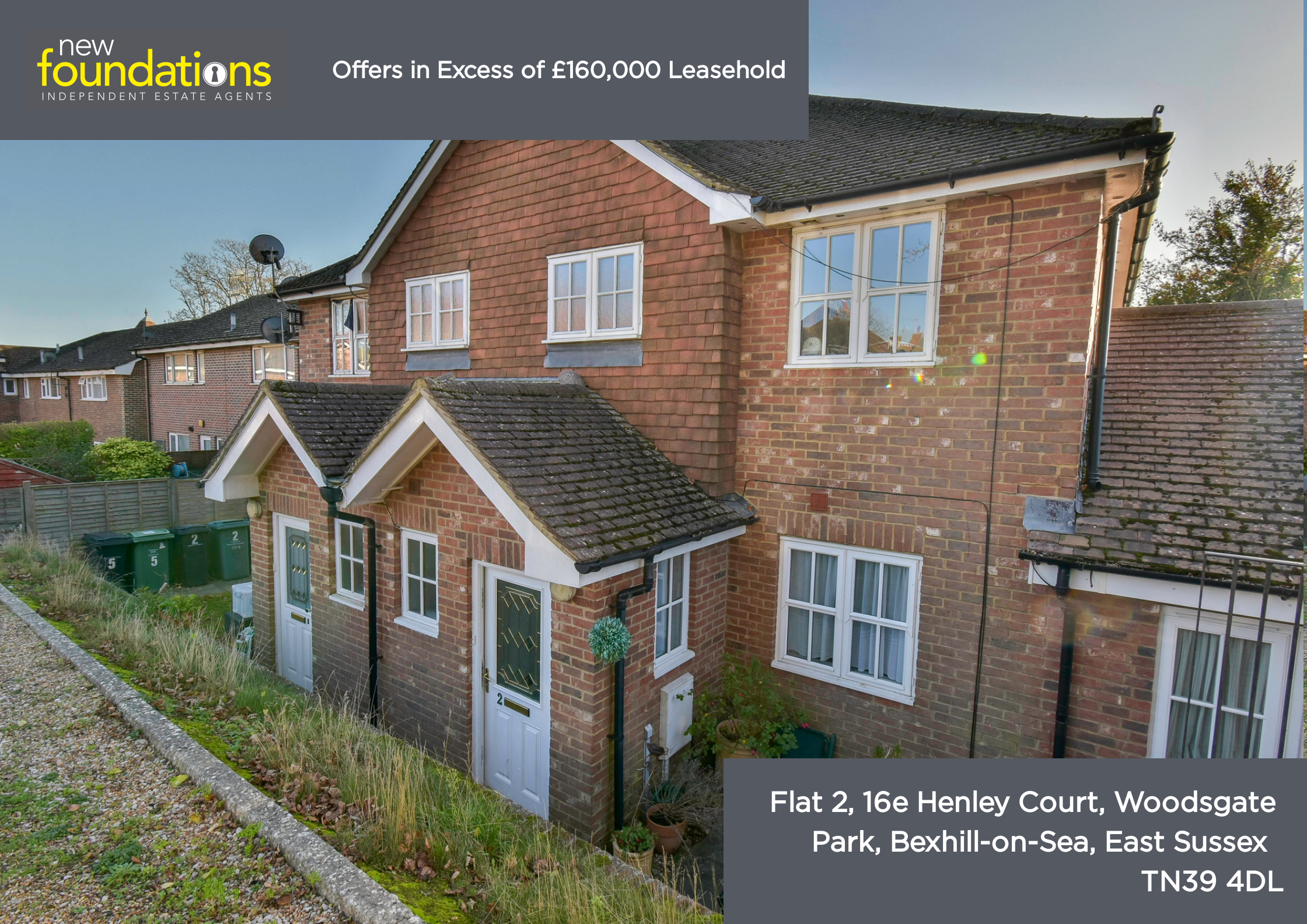
Flat 2, 16e Henley Court, Woodsgate Park, Bexhill-on-Sea, East Sussex TN39 4DL