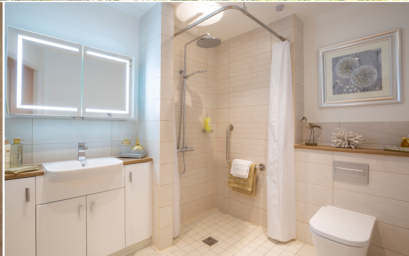
Marple Lane Chalfont St Peter, Buckinghamshire, SL9 9FU