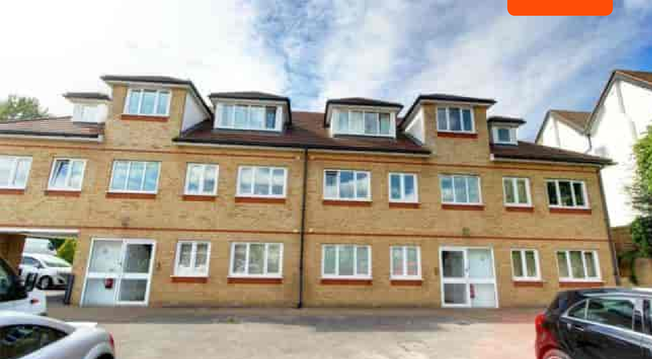
Vincent Close, Bromley, Kent. BR2 9ED