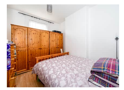
Lakehall Road, Thornton Heath, Surrey, CR7