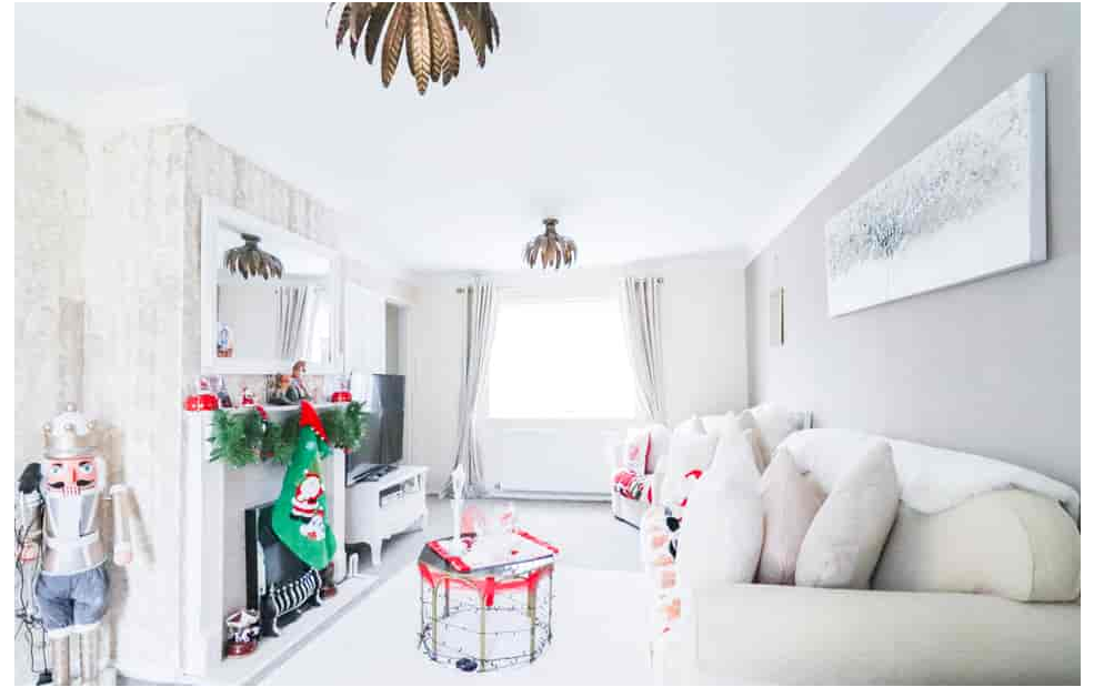
Greenfield Avenue, Northampton NN3 2BB Offers Over £200,000 - Freehold