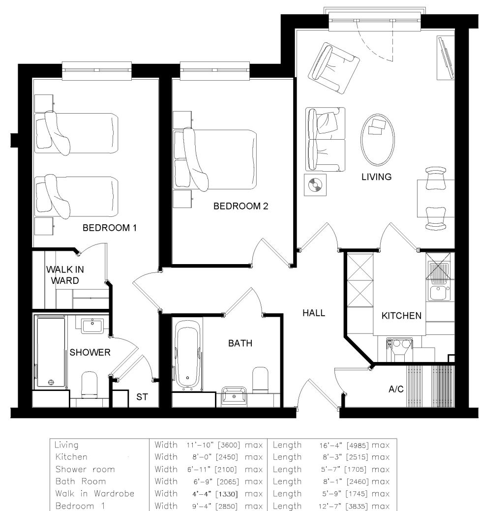
Walk in Wardrobe Bedroom 1 Bedroom 2 Width 9'-4" [2850] max Length 5'-9" [1745] max Bedroom 2 Width 9'-1" [2760] max Length 12'-7" [3835] max Length 13'-10" [4215] max Arrows denote measurement distances Although every effort has been made to ensure accuracy, exact room dimensions may vary during the course of construction and no responsibility can be accepted for any mis-statement on this leaflet, which is not a contract nor forms any part of any contract. The company also reserves the right to alter specification without notice.