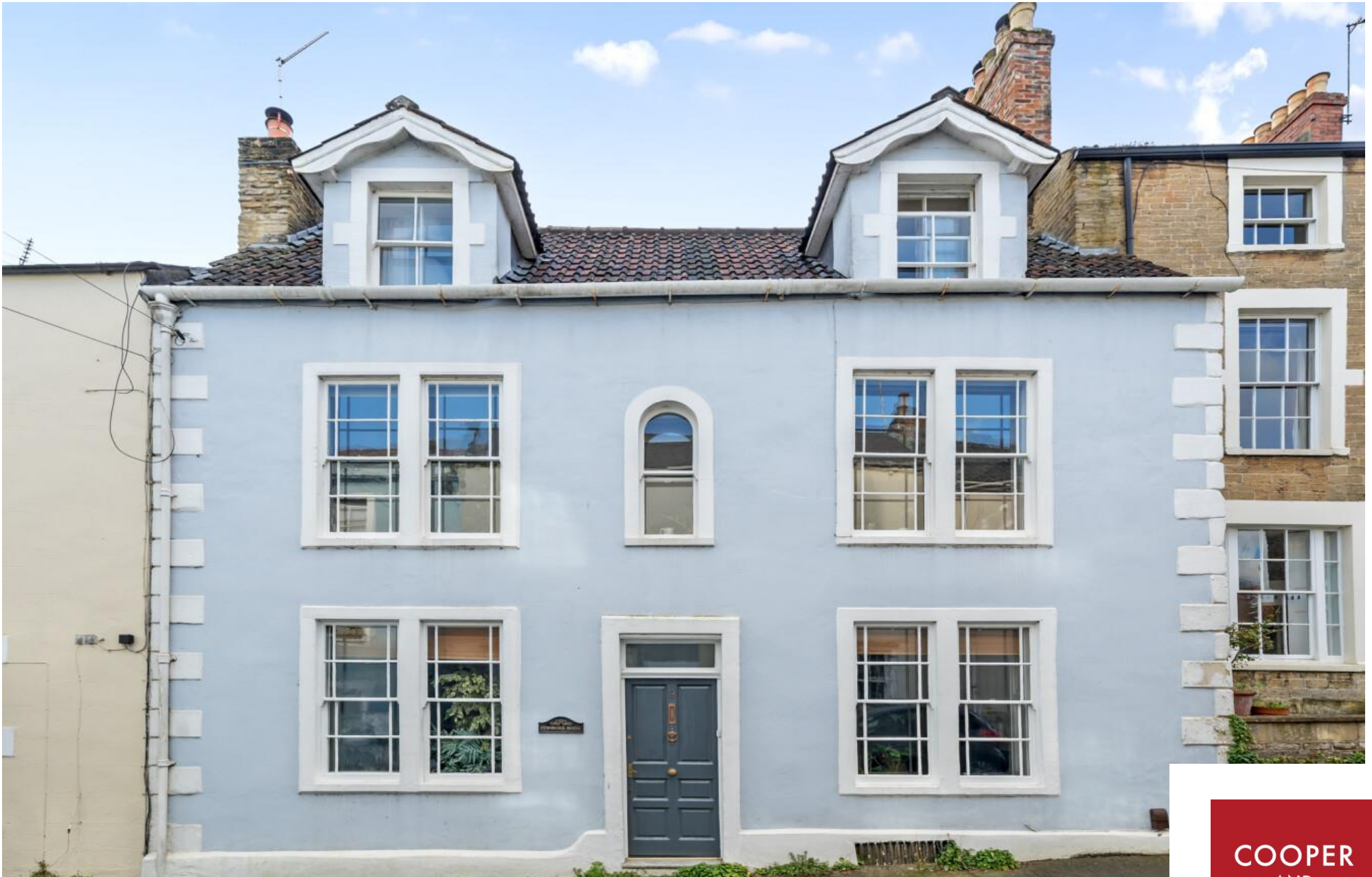
Pembroke House, 9 Catherine Street, Frome BA11 1DB