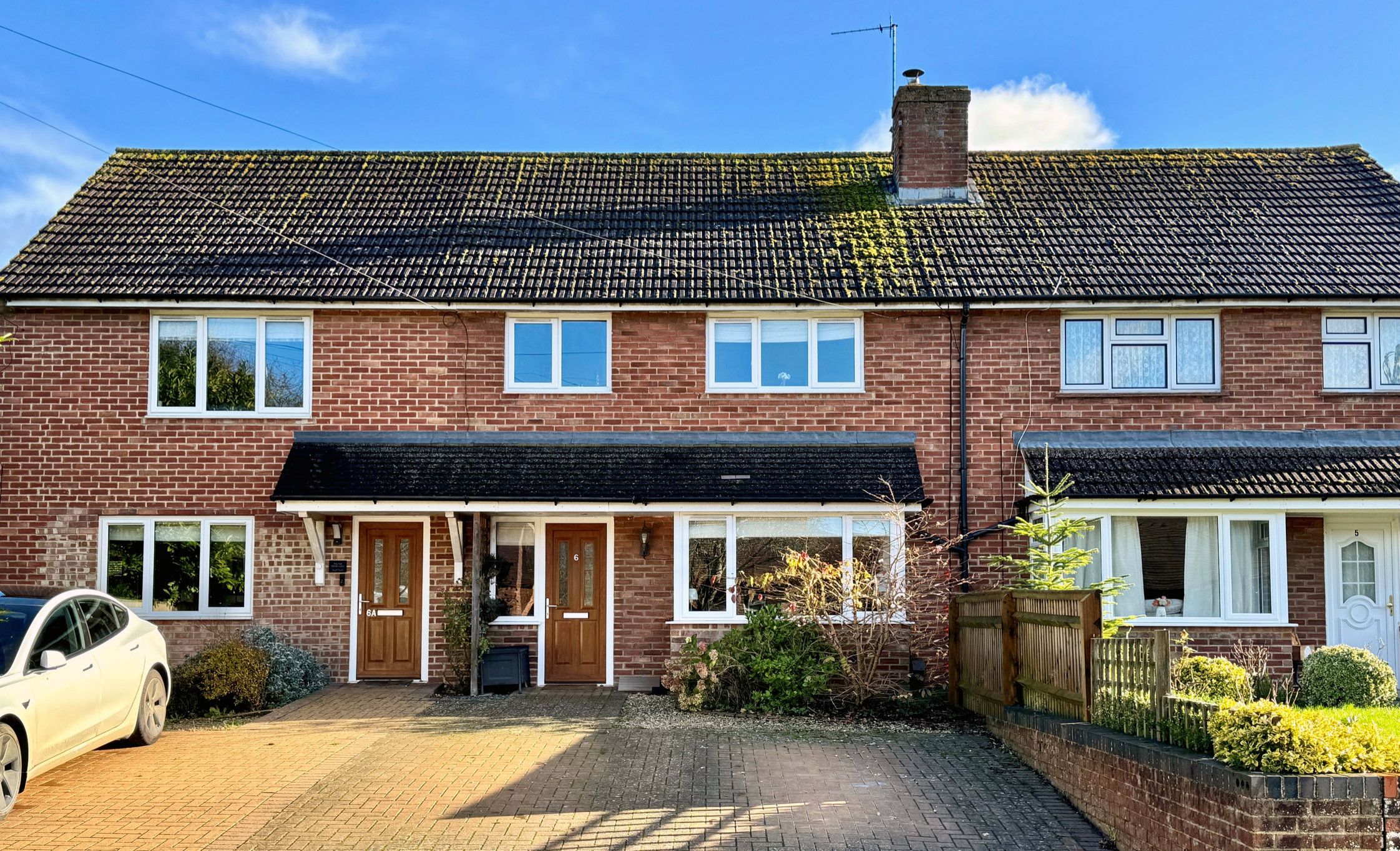
Winter Lane, West Hanney, Wantage Oxfordshire, £395,000