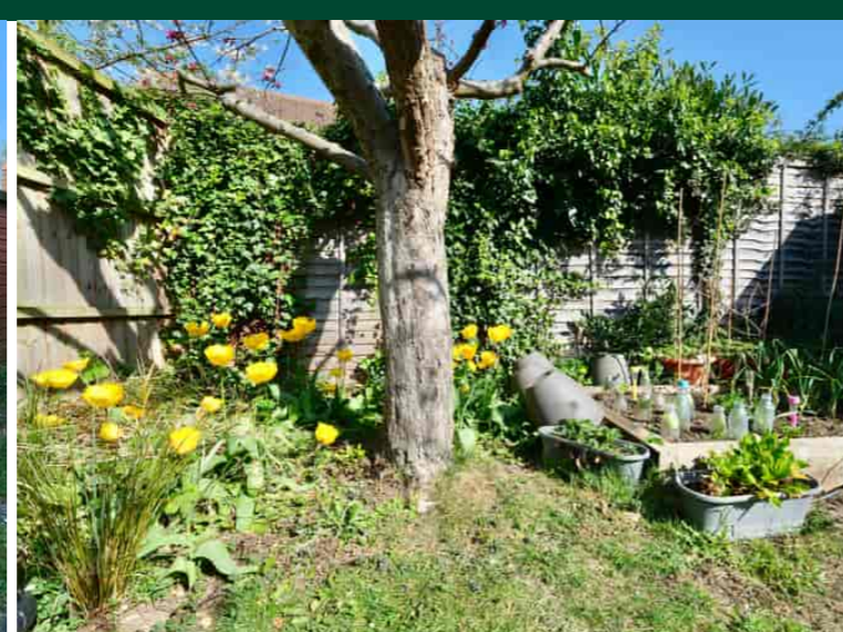
Lodge Close, Huntingdon PE29 6GR Guide Price £300,000