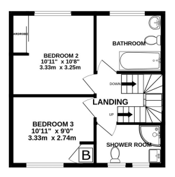
2ND FLOOR 254 sq.ft. (23.6 sq.m.) approx