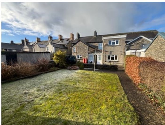
GARDEN (SECOND IMAGE)

To the rear of the property lies a low maintenance well maintained garden area with a concreted patio area that leads onto a level lawned area with mature hedge boundaries. Please note there lies a right of way for the neighbouring property. Further details available from the Sole Selling Agents.