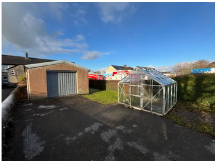
GARAGE (SECOND IMAGE)

22' 0" x 12' 5" (6.71m x 3.78m). With an up and over door, side service door, electricity connected.