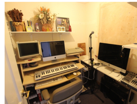
60 Elgar Drive, Shefford, Bedfordshire, SG17 5RA