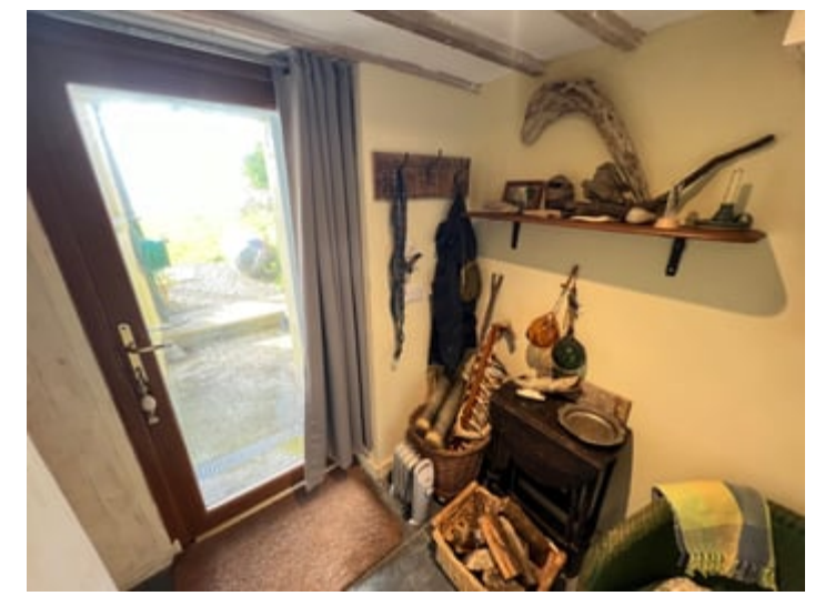
6' 4" x 5' 8" (1.93m x 1.73m) with glazed exterior door, slate flooring, exposed beams.