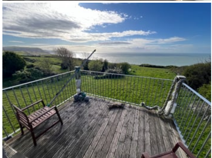
Balcony With galvanised ballastrail.