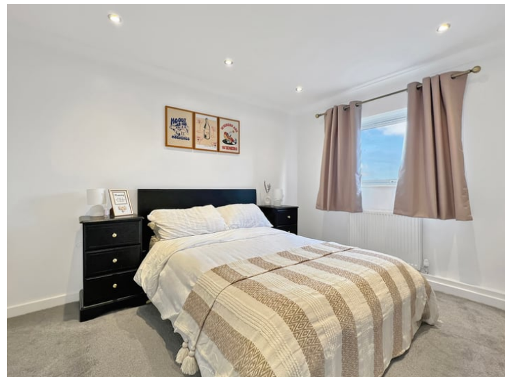
11' 04" x 8' 10" (3.45m x 2.69m)