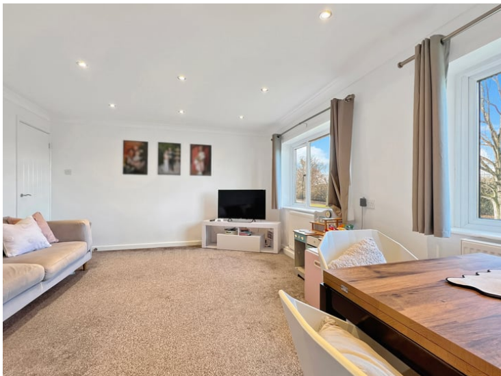
17' 10" x 12' 08" (5.44m x 3.86m)