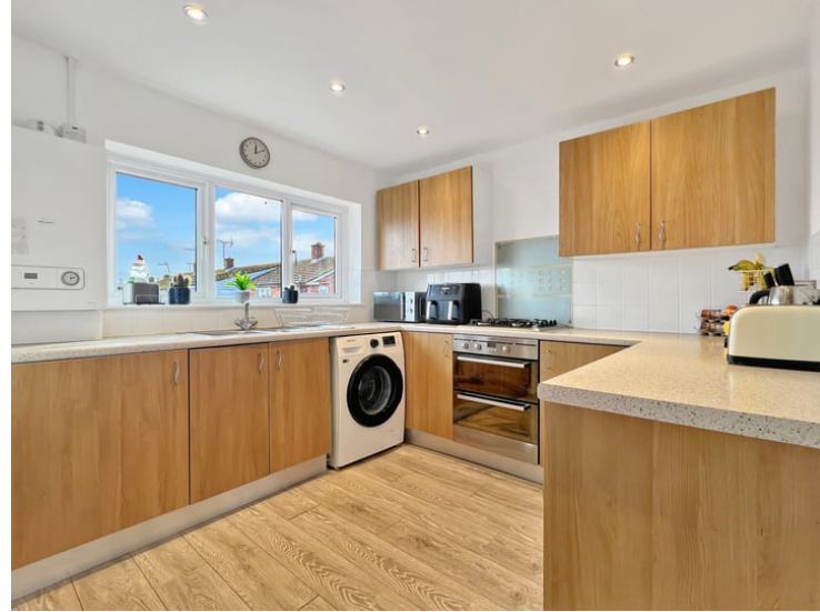
11' 03" x 9' 02" (3.43m x 2.79m)